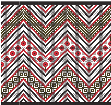
Maumahara – Remembering our fallen in battle.

Ōtākaro / Avon River Precinct will be a destination that encourages people to spend time near the river and places close to the river. It will connect with the public areas of the East and the South Frames, to create a people-friendly, accessible, greener corridor around the core of the city.