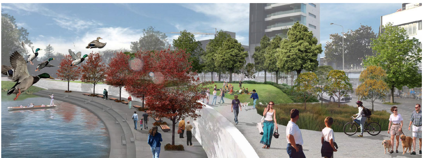
Artist impression showing what The Promenade will look like along Oxford Terrace, above the Canterbury Earthquake National Memorial.