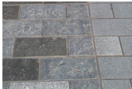
Examples of the paving that will be used.