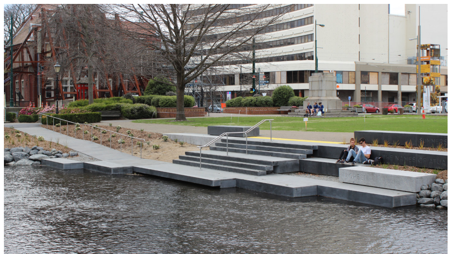
The boardwalk at the Watermark (left) and the Worcester East Terrace (right).