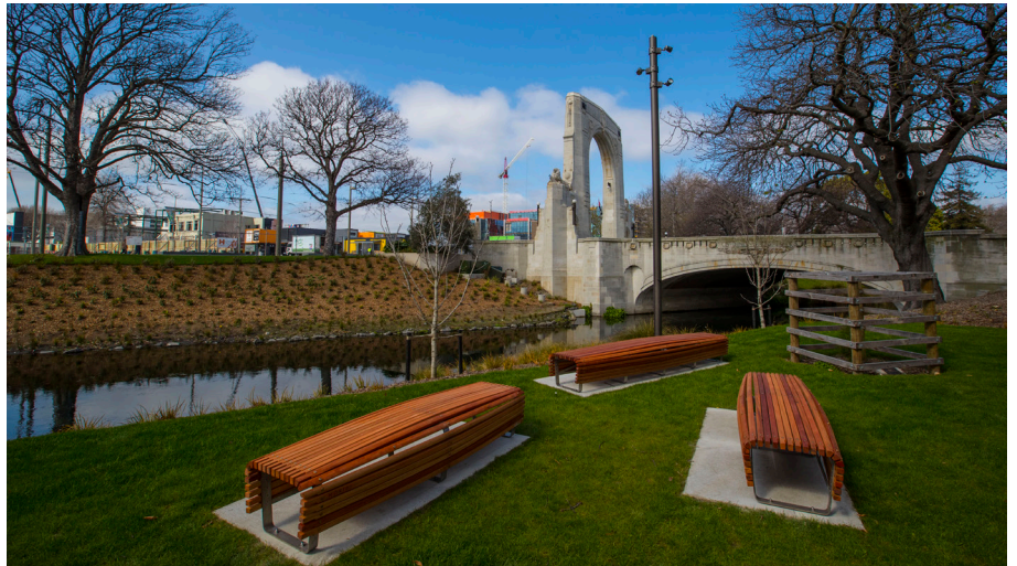
Street furniture installed near the Bridge of Remembrance. The seats are designed to bring to mind a waka.

Ōtākaro / Avon River Precinct will be a destination that encourages people to spend time near the river and places close to the river. It will connect with the public areas of the East and the South Frames, to create a people-friendly, accessible, greener corridor around the core of the city.